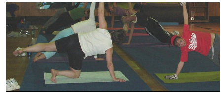
Fitness has never been so fun!

ZUMBA combines high energy and motivating music with unique moves and combinations that allow participants to dance away their worries. It is based on the principle that a workout should be "FUN and EASY TO DO." The routines feature aerobic/fitness interval training with a combination of fast and slow rhythms that tone and sculpt the body. Call 410-778-2083 or email info@KentParksAndRec.org for more information.